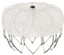
Figure 2. LAA closure device

The device is designed to close the left atrial appendage (which is known to be the main source of blood clots in patients with AF), preventing clots from forming in the LAA, or breaking free from it and travelling to the brain.