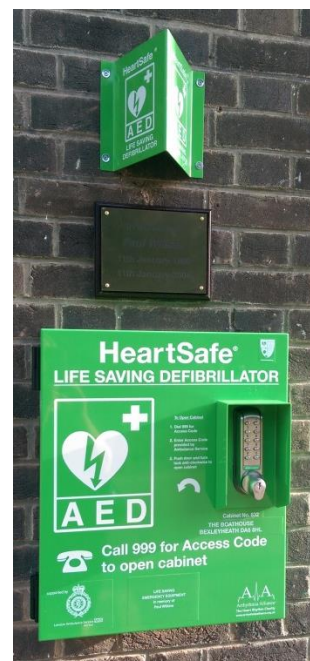
Danson Park Boathouse