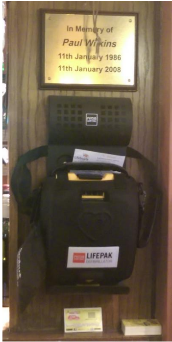
The Lord Kitchener Pub