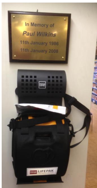
7 Day Chemist

Find out more about placing an AED in your community at www.defibssavelives.org